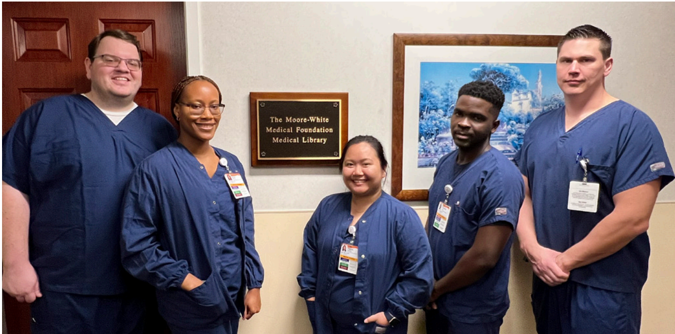
Ross University School of Medicine students in front of the Moore–White Medical Foundation Medical Library.