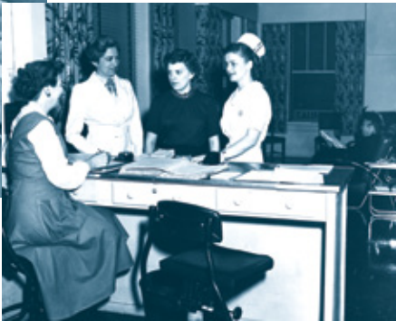
Outpatient clinic 1954