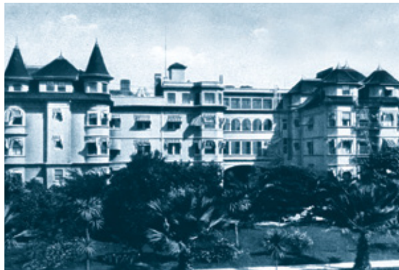
Vintage postcard of the hospital