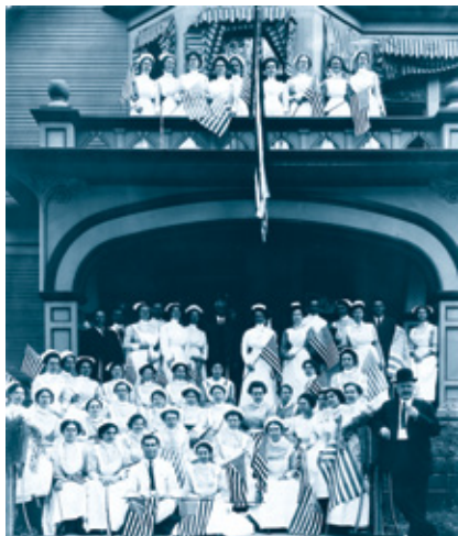
President William Taft (left, back row) visiting the California Hospital School of Nursing