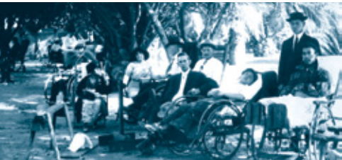
Early patients in the "new" Hope Street hospital