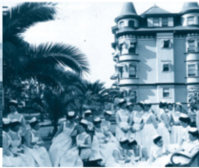
Nursing class 1905