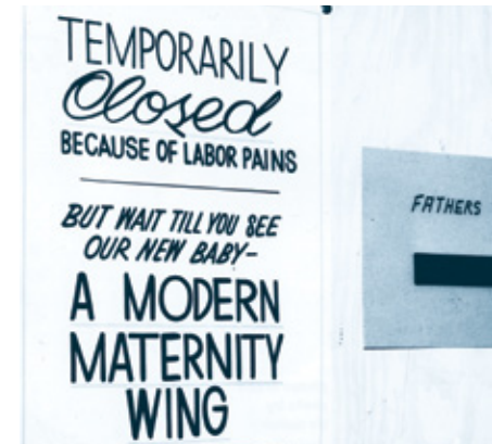
Growing to meet the needs of the community in its early years