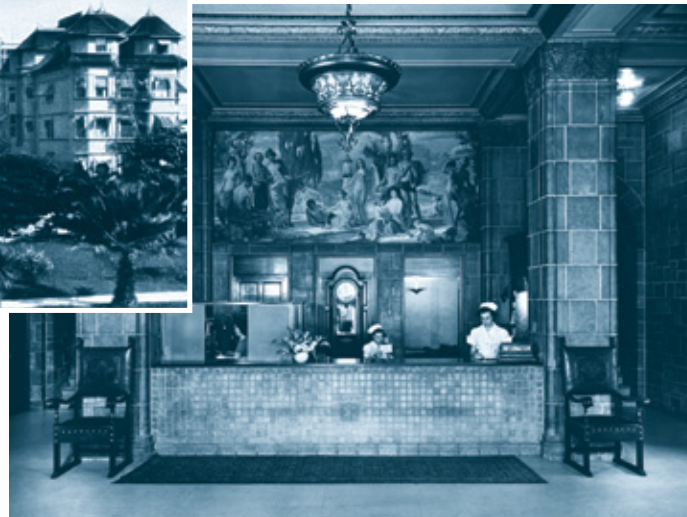
Information desk in the lobby