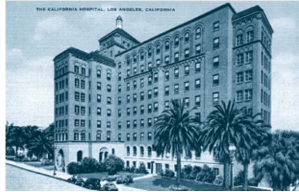
The new 1926 Hope Street hospital building 1920s