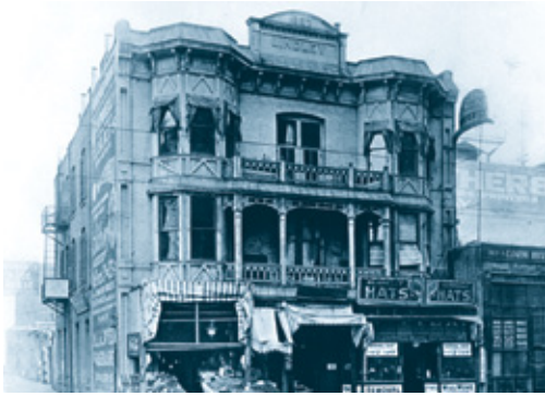
California Hospital's first building at 315 W. 6th Street, Los Angeles 1887