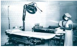
● 1952 Surgical suite