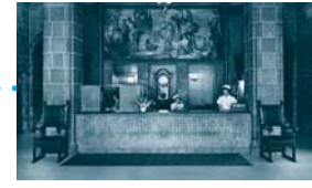
● 1920s ● Information desk in the lobby