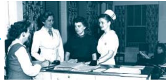
● 1954 Outpatient clinic