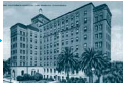
● 1920s ● The new 1926 Hope Street hospital building