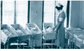
● 1933 The nursery