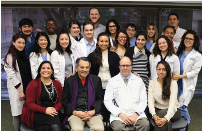
2017 CHMC/USC Family Medicine Residents