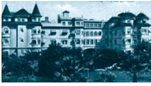
● 1910 ● Vintage postcard of the hospital