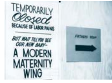
● 1940s Growing to meet the needs of the community in its early years