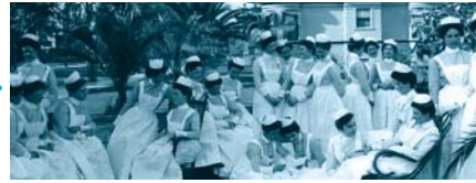
● 1905 ..... Nursing class