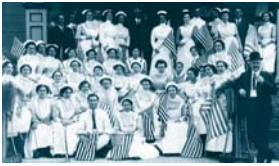
● 1904 ..... President William Taft (left, back row) visiting the California Hospital School of Nursing