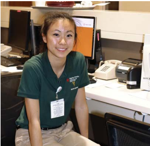
COPE Health Scholars receive hands on experience in various hospital departments.

professions in the ever changing world of medicine. Approximately 100 students take part in core and elective rotations in Internal Medicine, Surgery, Pediatrics, Obstetrics and Gynecology, Psychiatry, Cardiology, Emergency Medicine, Endocrinology, ENT, Nephrology, Orthopedics, Radiology, Pathology, Infectious Disease, Neurology, Sport Medicine, Ambulatory Medicine, Hematology/Oncology, Pathology, Anesthesia, Plastic Surgery, and Family Medicine.