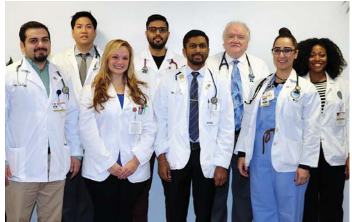
Ross University School of Medicine 2017 Medical Students